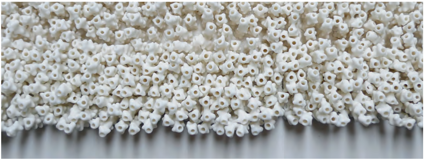
On The Road (Retail) : Porcelain