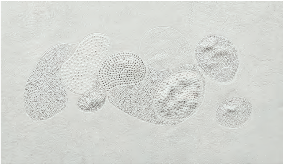
Variation DR: Paper porcelain tableau - 2019-004