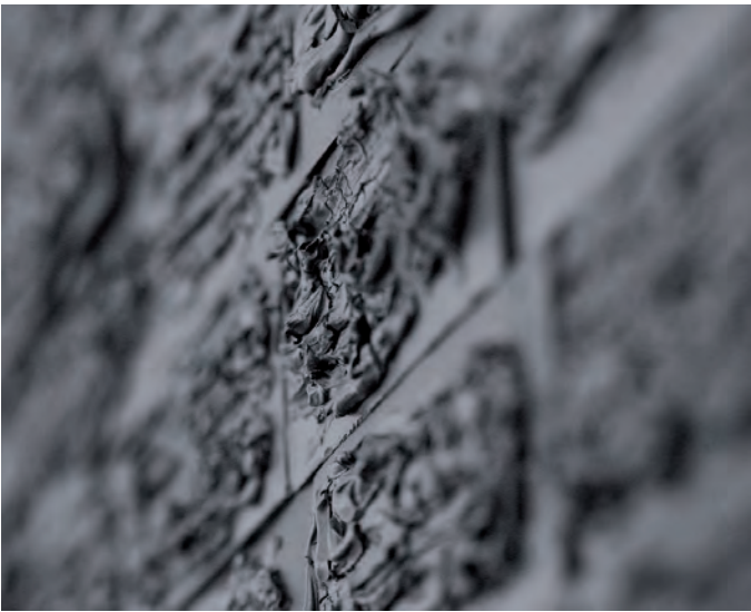
Ouidah (detail) : Wall panel of black porcelain 60 x 200 cm