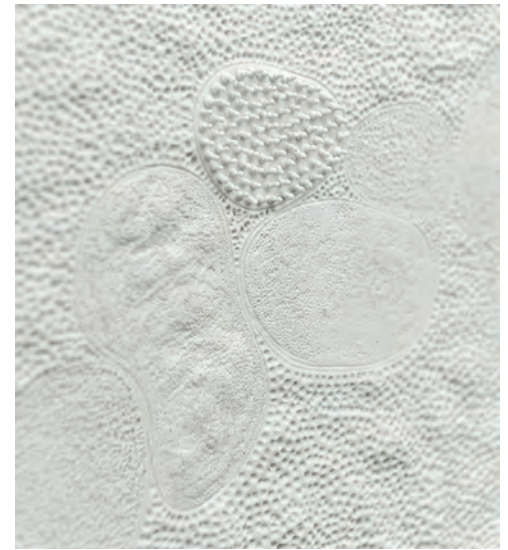
Variation DR (detail)