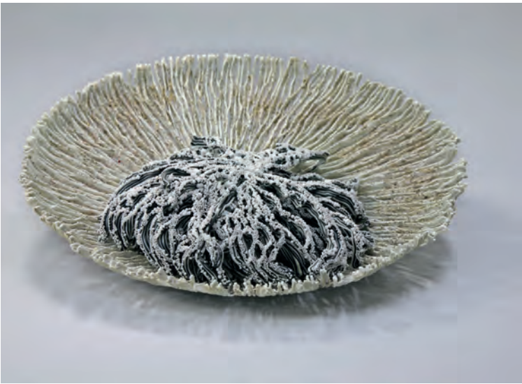
L'Intrus , Black and white porcelain filaments, sand and alumina beads. ø 35 cm - H 10.5cm