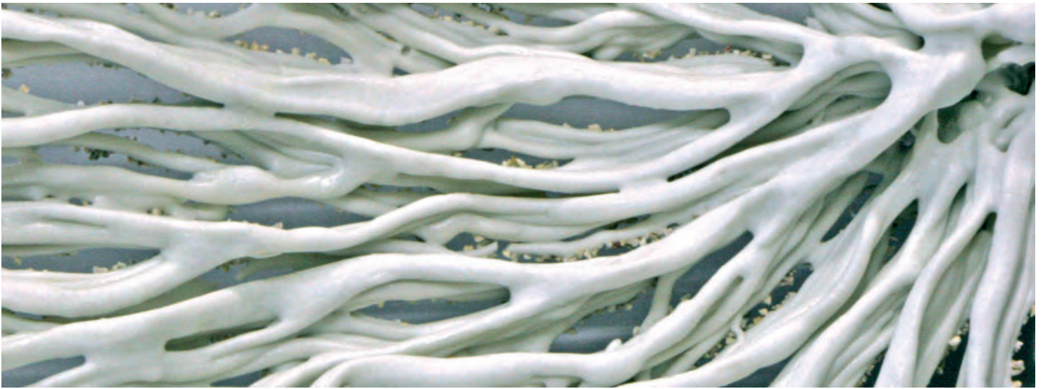
Chimère (detail) : White porcelain filaments, sand