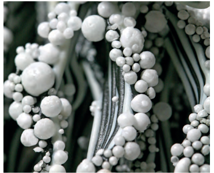
L'Intrus , detail