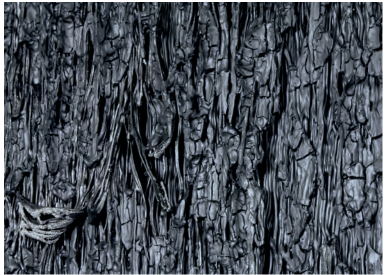
A Taste of Chaos (retail) : Wall panel of black porcelain filaments and sand. 190 x 200 cm