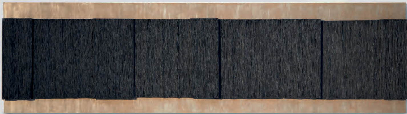
Black Whisper : Plaques de papier porcelaine noire et décor à la poire. Montage sur médium ciré et aimanté. 48 x 168 cm